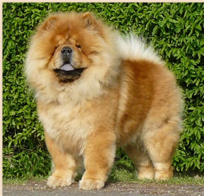
figure in this vast project. He is the one to contact, for all matters regarding ‘The World of Chows’; delivering copy, placing adverts, buying books, everything.

In principle a correspondent has been appointed in every country. Your fellow countryman is the key